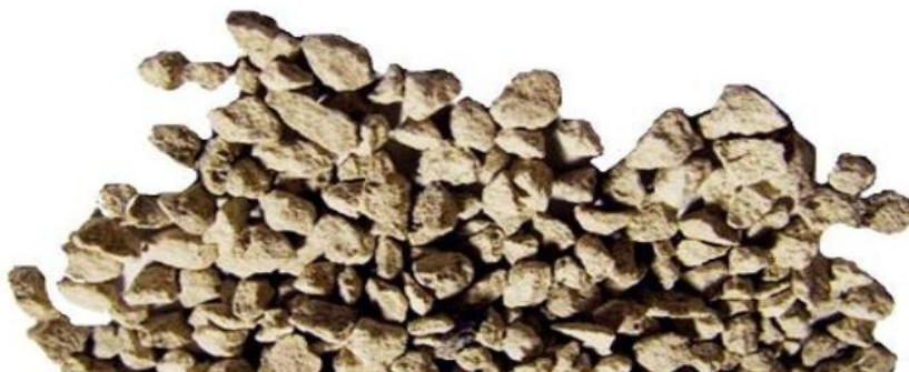
PERRY AMMOSORB 100-PF MEDIA

This information is offered solely for your consideration and verification. It has been gathered from reference materials and/or test procedures and is believed to be true and accurate. None of this information shall constitute a warranty or representation, expressed or implied for which we assume legal responsibility or that the information or goods is fit for any particular use either alone or in combination with other goods or processes.